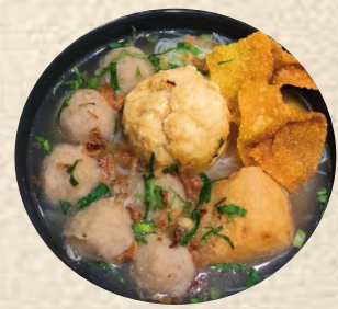
Bakso komplit malang