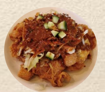
Tahu telor goreng

Deep fried eggplant served with sambal $7.5