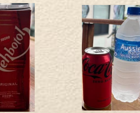
Softdrinks/ water bottle $2.8