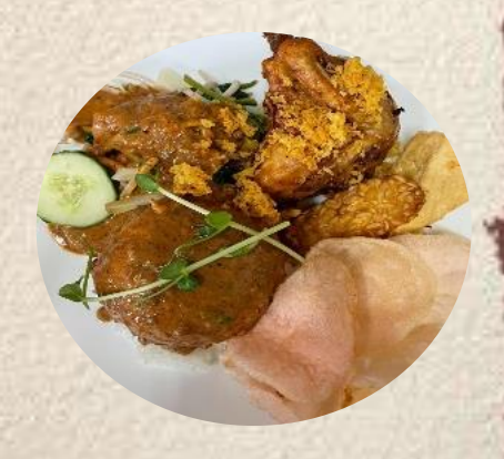
Nasi pecel ayam

Nasi Pecel+Ampela (chicken giblet) $18.5