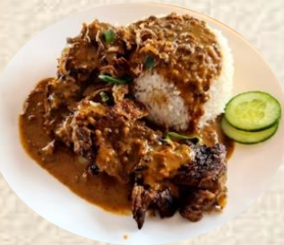
Iga bakar saus kacang