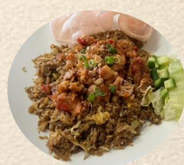
Nasi goreng geprek