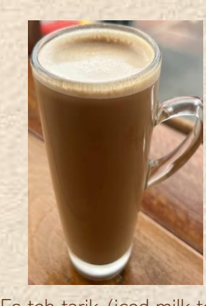
/Hot teh tarik $5