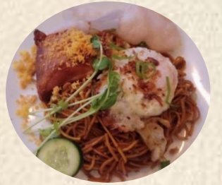
Mie goreng ayam kremes