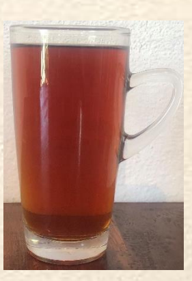
Es teh tawar/manis (iced tea)$4 Lemon Squash $5 Teh tawar/manis panas (hot tea) $4