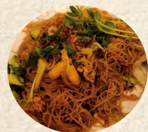
Bihun goreng seafood