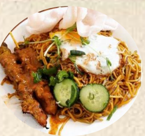
Mie goreng sate

Fried kwetiau mixed with seafood egg & bean sprout $17