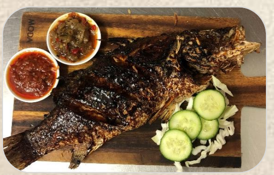
Ikan bakar barramundi