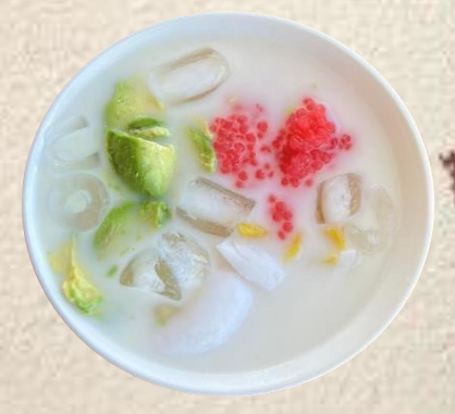
Es Teler $8.5