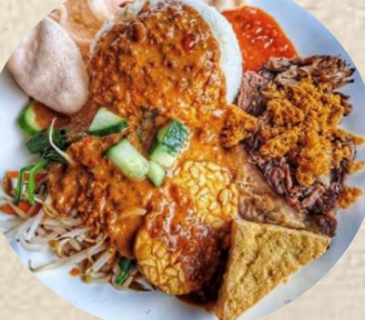
Nasi pecel empal